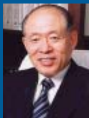
Ryoji Noyori, Nagoya University and RIKEN, Tokyo, Japan